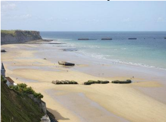
The floating harbour off Arromanches , from D-Day in WW2.

Exemplary with the wealth of the collection exhibited and the innovation of its presentation, a unique place. It is the quintessential starting place for an understanding of the events that took place leading to D-Day.