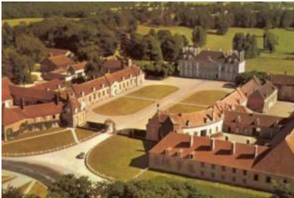
Haras du Pin

the French National Monuments register (the other is Compiègne).