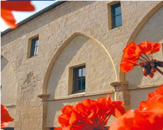
Best Western Hotel Le Dauphin